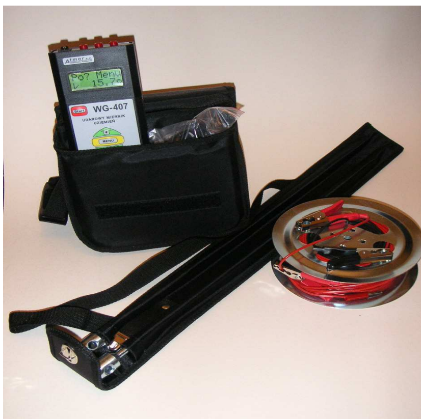
Rys. 2. General view of the meter and its accessories: 1- the meter WG-407, 2 – bag, 3 – reel with conductors, 4 – net power supply for battery charging, 5 – protective cover of measurement probes

The WG-407 meter with its accessories has been shown in Fig. 2